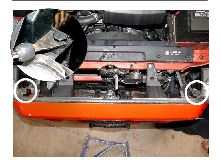
Step 1 Open vehicle's hood. Using a plastic removal tool or similar tool locate and remove 2 factory clips circled above holding the factory grille onto vehicle. Save hardware for reinstallation.