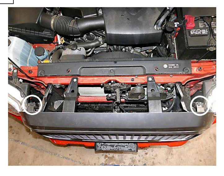
Step 2 Reinstall 2 factory clips circled above to secure grille in place.