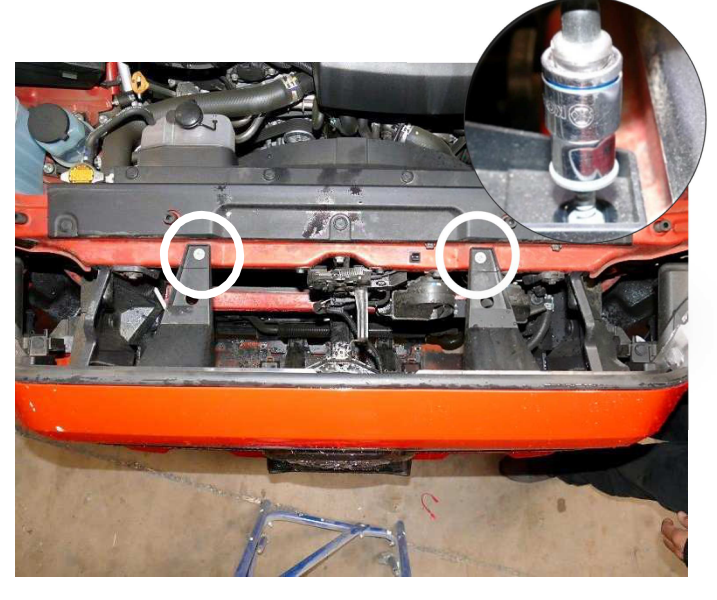
Step 2 Using a 10mm socket locate and remove 2 factory bolts securing the factory grille onto vehicle. Save hardware for reinstallation.