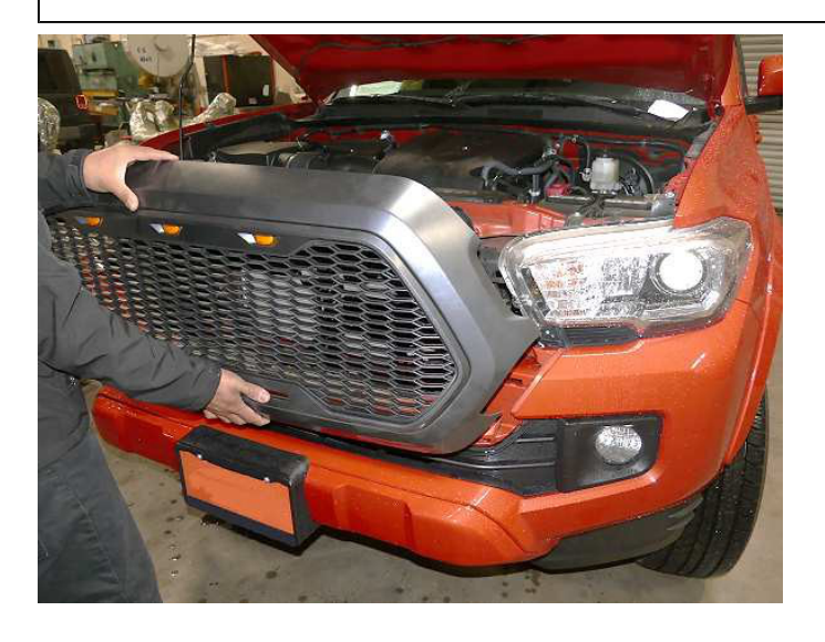
Step 1 Place supplied grille (A) onto vehicle as shown above.