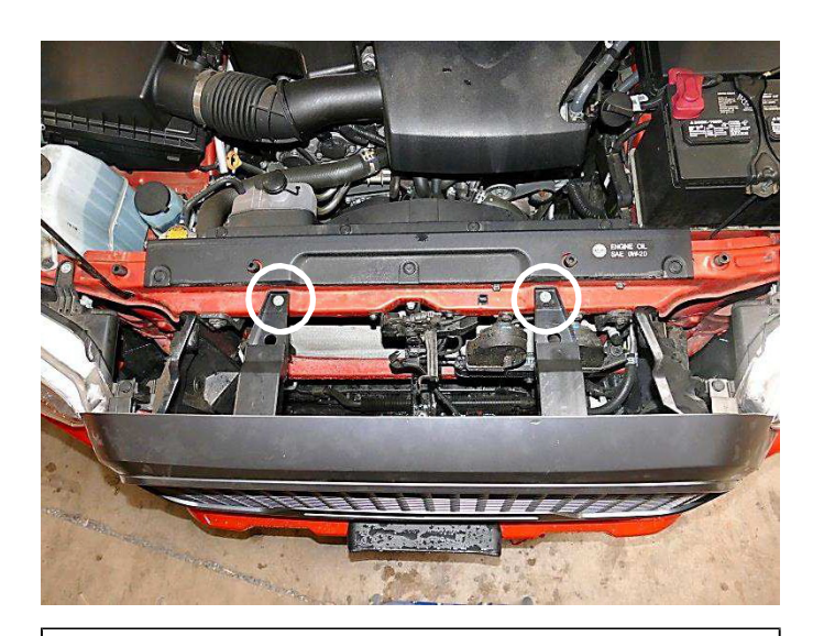
Step 3 Using a 10mm socket reinstall 2 factory bolts to secure grille onto vehicle.

Proceed to make electrical connections for the LED lights. If you are not qualified to make the proper connections, we highly recommend that you contact an installation expert to complete the connections.