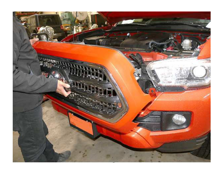
Step 3 Firmly grab and pull factory grille off of vehicle. Discard factory grille.