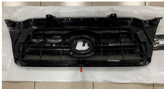
Put frame on Grille and match each hole with rib