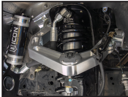
[TECH NOTE #3]

RETORQUE ALL NUTS, BOLTS AND LUGS AFTER 100 MILES AND PERIODICALLY THEREAFTER.