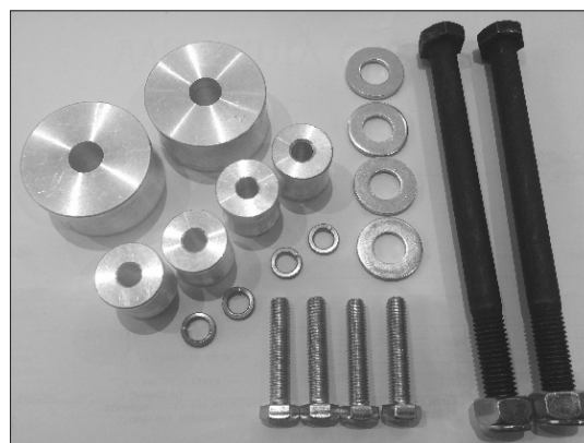
Front aluminium spacers