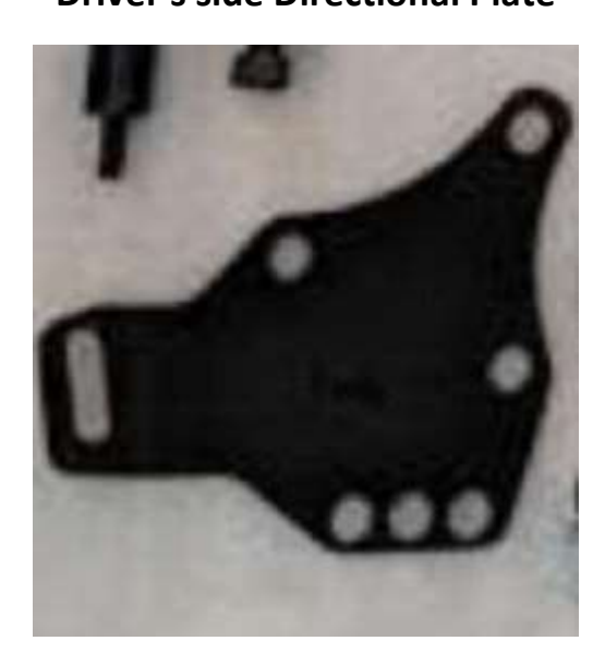
Driver's side Directional Plate

Drivers side directional plate. If it is facing down it is the Passenger plate.