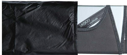
Optional Storage Bag Shown

Simply reverse the installation steps, fold the unit and store in the trunk or under a seat.