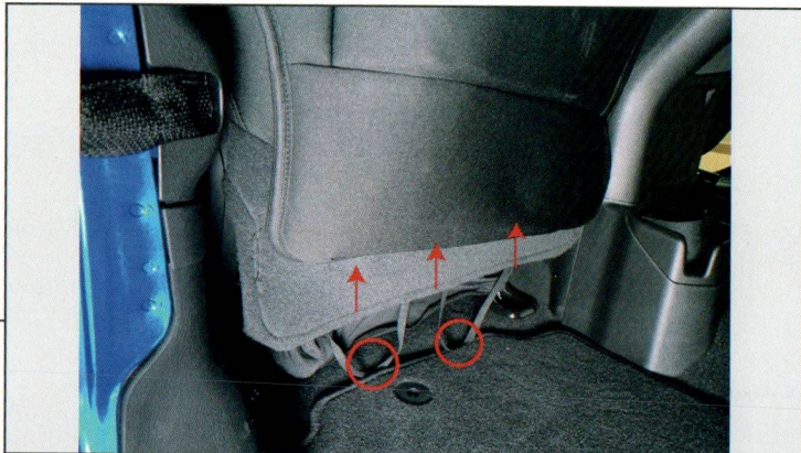
STEP 2 (FRONT)

Remove the head rest from the seat. Using the front backrest cover, drape the cover over the vehicle seat. The airbag cutout will face out.