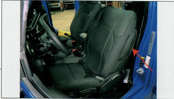
STEP 1 (FRONT)

Remove the head rest from the seat. Using the front backrest cover, drape the cover over the vehicle seat. The airbag cutout will face out.