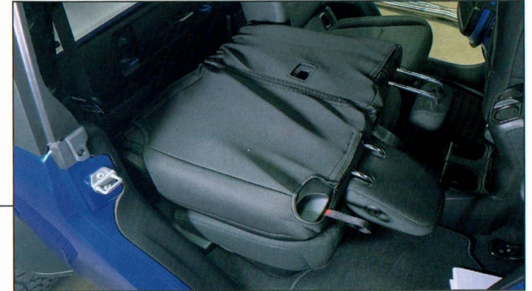
STEP 1 (REAR)

Fold the rear seat backrest down. Unzip the middle section of the backrest, and lay the cover over the backrest. Undo the Velcro around the headrest and reattach the Velcro underneath the headrest to keep the backrest tight against the seat.