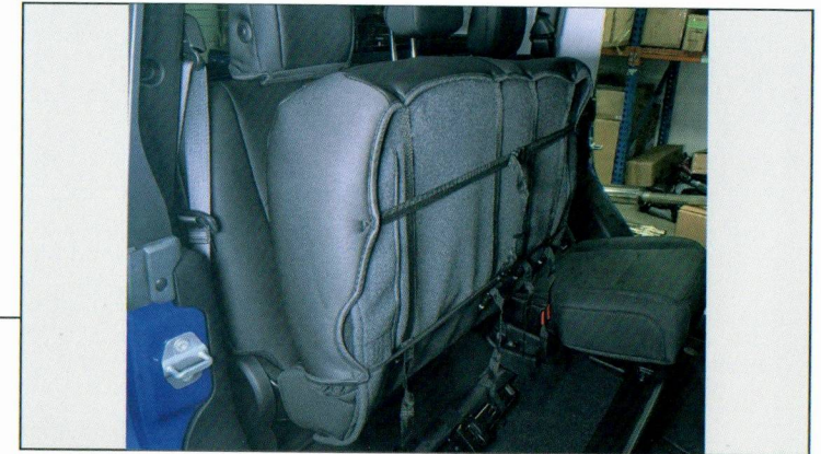
STEP 5 (REAR)

Lift the base of the seat and secure the (4) straps into each clip, as well as the (1) horizontal clip going across the base. Using the elastic straps, connect the straps under each individual seat to hold the seat cover tight.