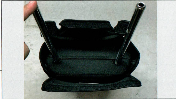
STEP 5 (FRONT)

Pull the headrest seat cover over the headrest. Using the Velcro on the headrest, pull the Velcro together to hold the seat cover tight. Reinstall headrest to the seat.