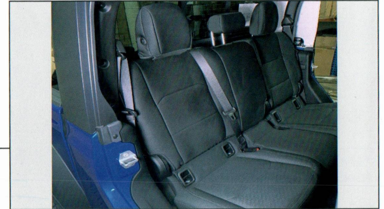
STEP 2 (REAR)

NOTE: Be sure to pass the seat cover under the seat belt to prevent covering the seat belt during installation.