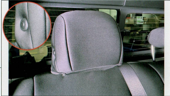
STEP 3 (REAR)

Install the head rest cover, slide the cover over the headrest and join the Velcro strips together. Then tuck the headrest cover behind the headrest tilt button.