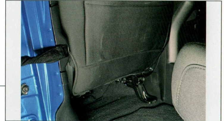
STEP 3 (FRONT)

Tuck the front flap through to the back of the seat. Tuck the factory seat back upwards between the seat and seat cover. Pull the front flap up the back of the seat and attach it to the Velcro portion of the seat cover.