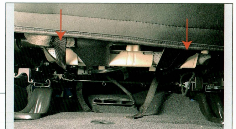
STEP 4 (FRONT)

Tuck the front flap through to the back of the seat. Tuck the factory seat back upwards between the seat and seat cover. Pull the front flap up the back of the seat and attach it to the Velcro portion of the seat cover.