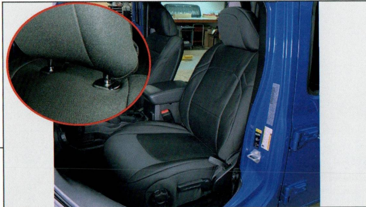
STEP 6 (FRONT)

Pull the headrest seat cover over the headrest. Using the Velcro on the headrest, pull the Velcro together to hold the seat cover tight. Reinstall headrest to the seat.