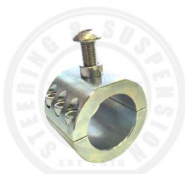
FOX ATS VERSION