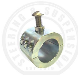
FOX ATS VERSION