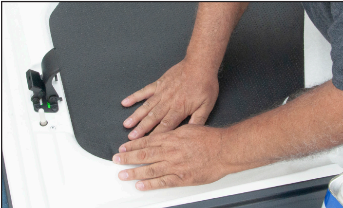
Figure 6. Apply pressure by hand for proper adhesion

5.) Once the starting edge is adhered, lay down the rest of the part while pulling the backer liner off while applying gentle pressure by hand as shown in Figure 5.