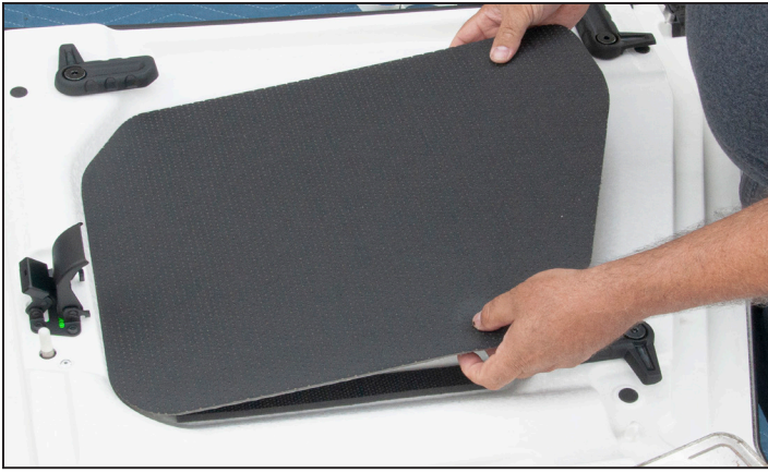
Figure 5. Lay panel in place by applying gentle pressure

5.) Once the starting edge is adhered, lay down the rest of the part while pulling the backer liner off while applying gentle pressure by hand as shown in Figure 5.