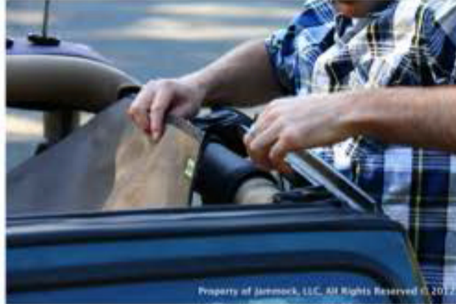
2.) 1987-2006: Slide webbing around the driver's side roll bar