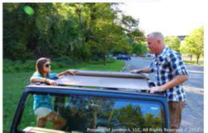
6.) Your Jammock should be taut and secure, check that it is prior to use.