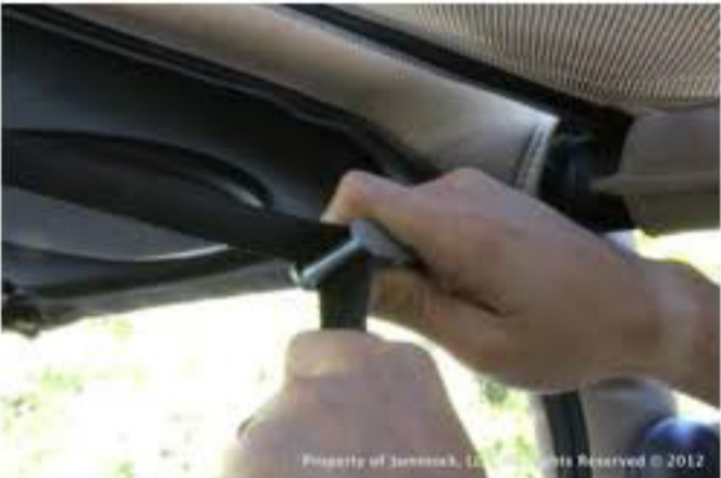
4.) Insert the webbing into the buckles and tighten. Pull on the webbing to make sure it cannot slide out unless you release the buckle.