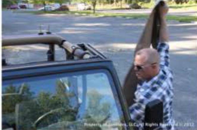
1.) Unfold the Jammock.

Prior to installation, please remove your soft-top or hardtop. If you've got a Freedom Top, we recommend removing the two front panels and loosening the TORX nut on the large part of the top on the driver's side door, so you can slide the buckle through the gap. If you have a soft-top, loosen the driver's side drip rail retainer or back part of Freedom Top so you can eventually slide the buckle through. FOR ALL JEEPS: Make sure that you have mated the webbing correctly with the buckles. The webbing should not be able to move freely from the buckle unless you press the release lever