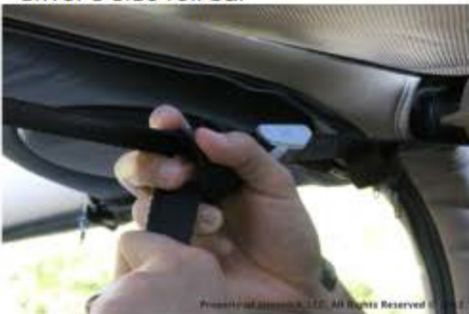
5.) Tie off the ends.