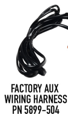
FACTORY AUX WIRING HARNESS PN 5899-504

The light bar is designed to work with the factory AUX switches if your vehicle is not equipped with the factory AUX switches you can add optional wiring harnesses to ease installation. We also offer full wireless controller options. (SOLD SEPARATELY).