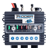
TRIGGER 6 SHOOTER PN 3001