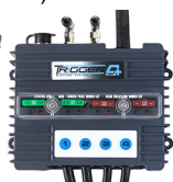
TRIGGER 4 PLUS PN 2100