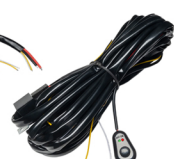
SWITCHED WIRING HARNESS PN 5897-504