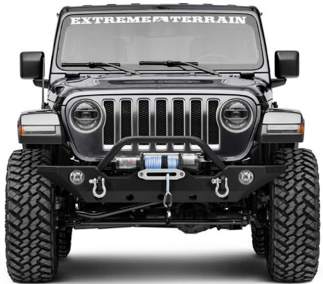
Installed Wrangler JL