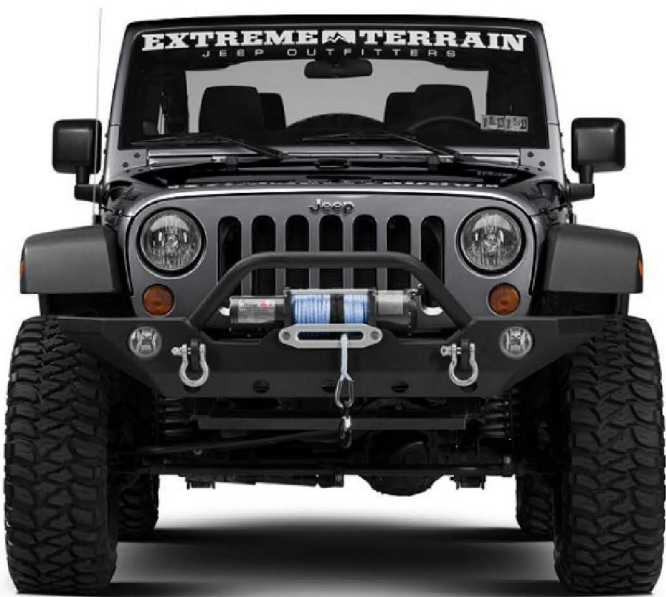
Installed Wrangler JK

With help, carefully install the bumper. Secure the bumper to the vehicle using the provided M12 hardware. Reconnect the fog lights (extending the wiring may be required). Installation is now complete.