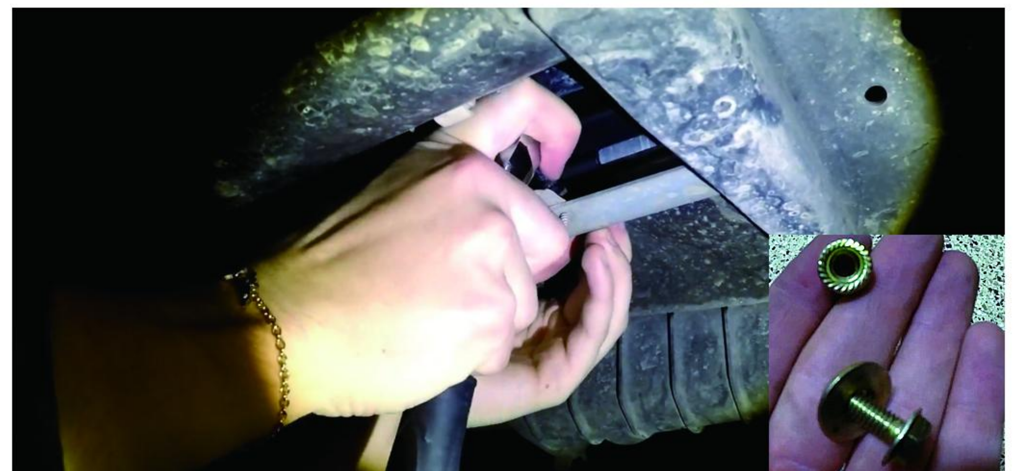
Now use the provided hardware to hold the bottom of grille into place.