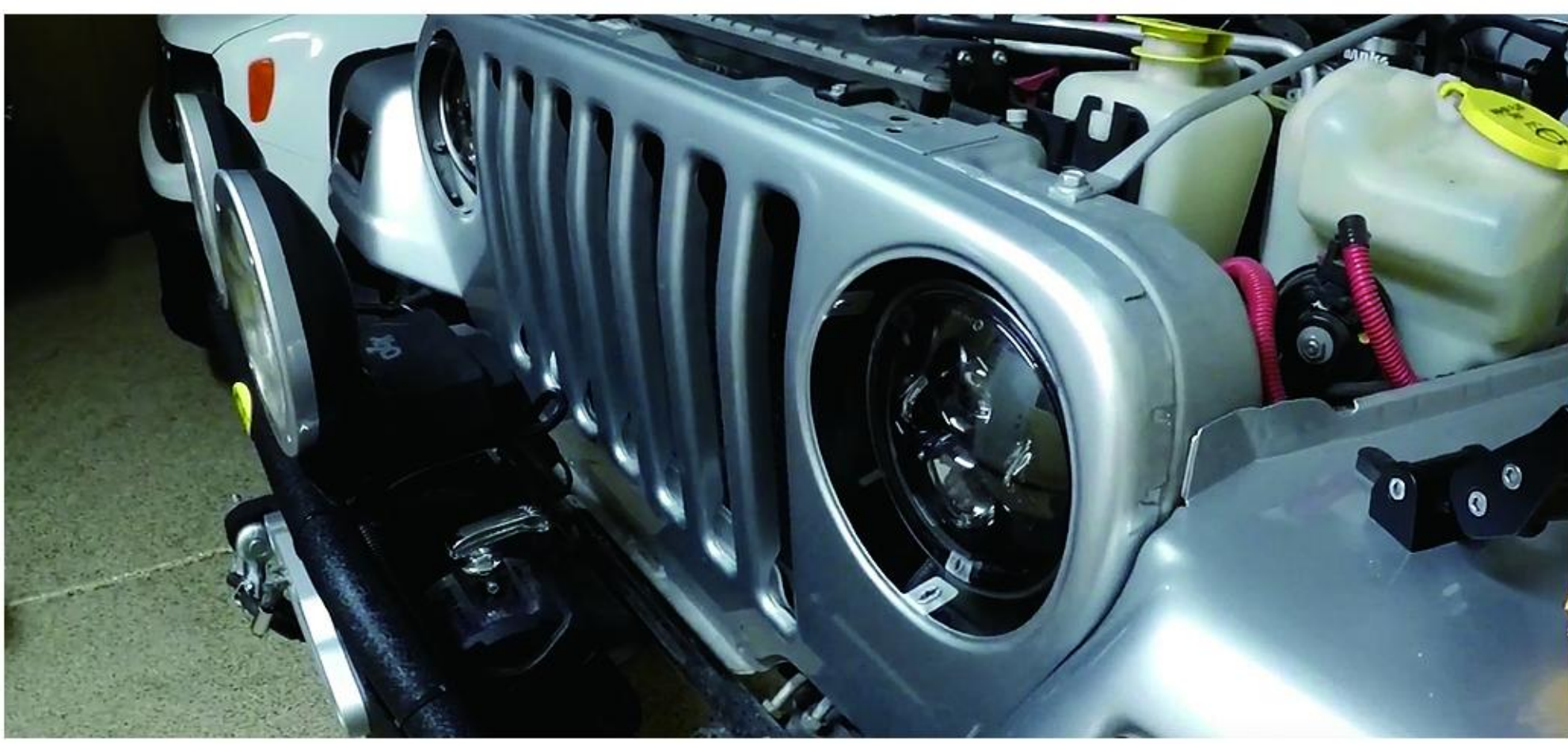
Now remove the guard from the bumper.