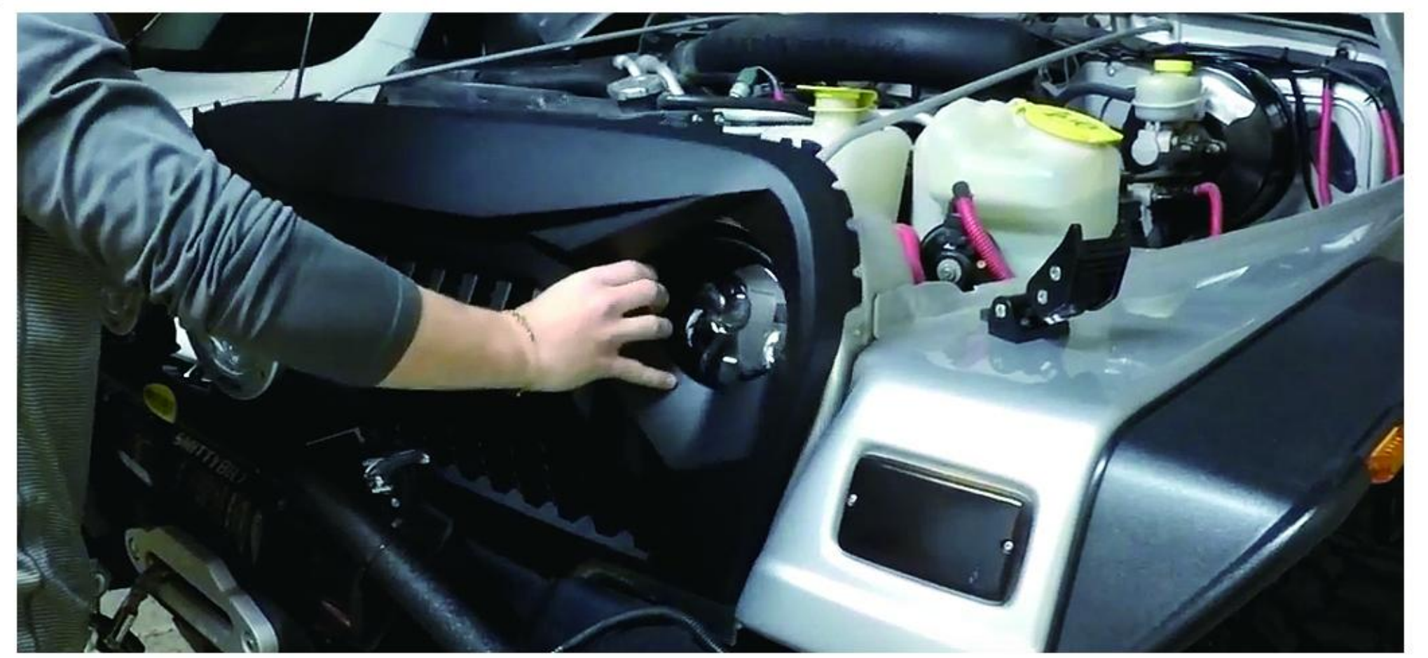
Place aftermarket grille into place by lining up the two existing bolt holes.