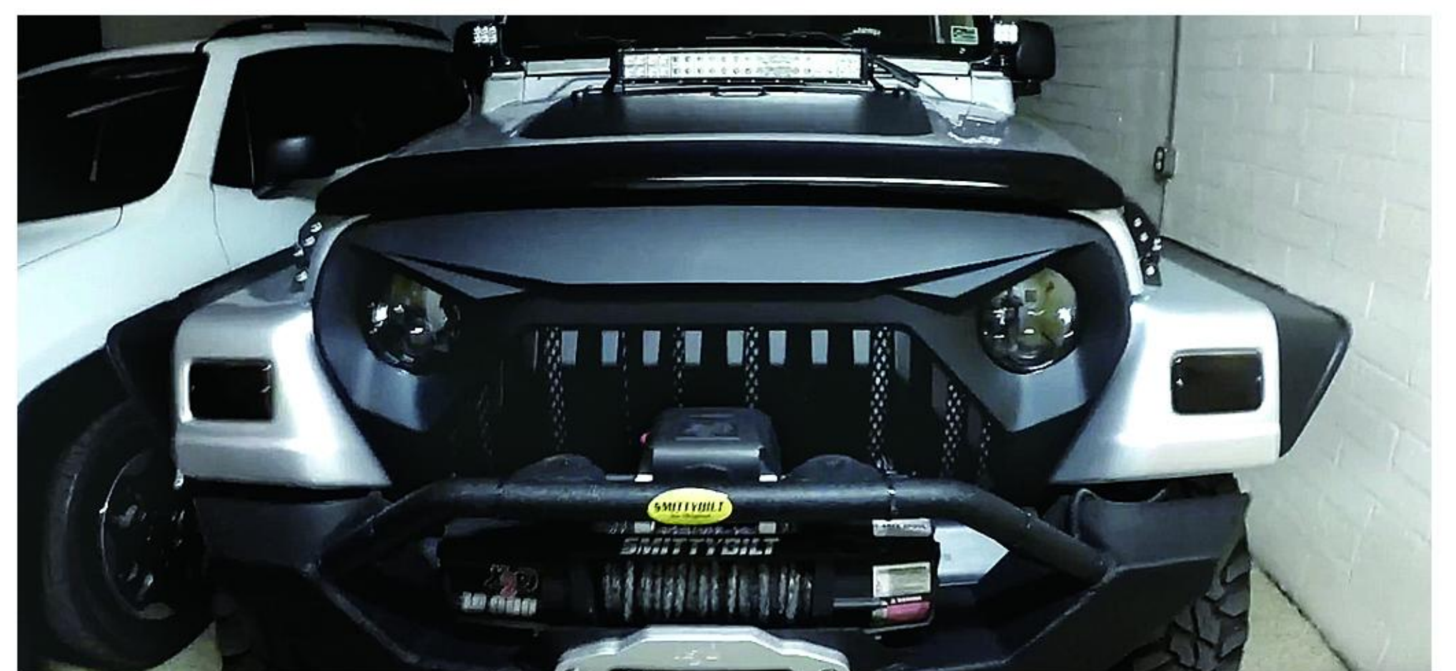
And a final wipedown to complete the install.