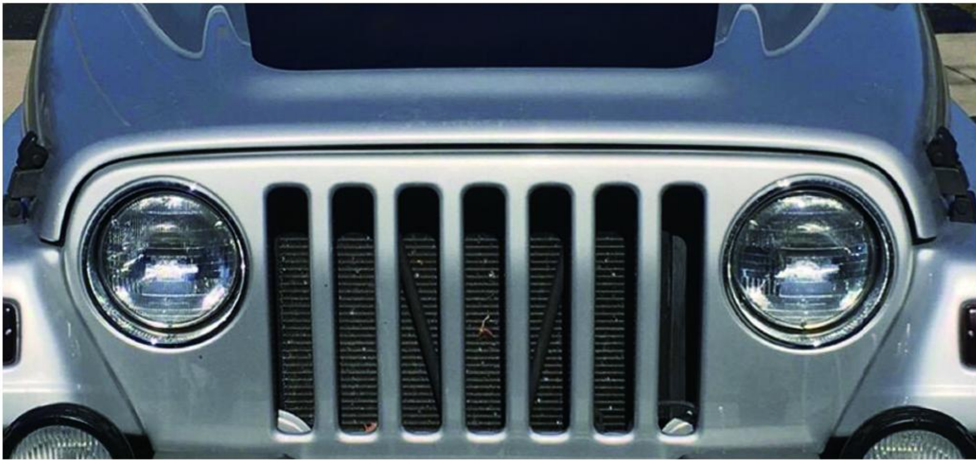
Prep Area: Remove headlight bezels and clean surface.