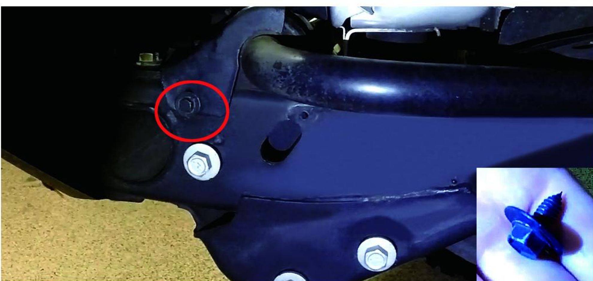
Put the factory guard back into place and bolt back together.