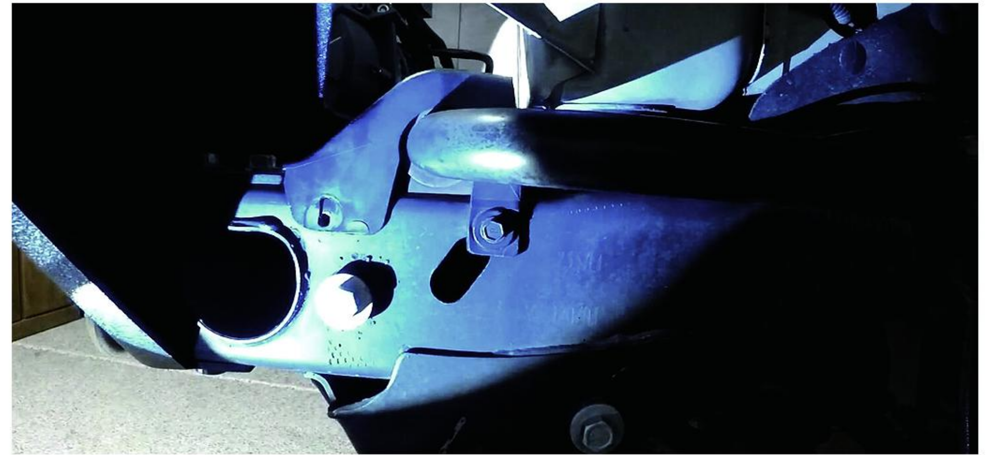
Remove both lower bolts holding the factory guard into place.