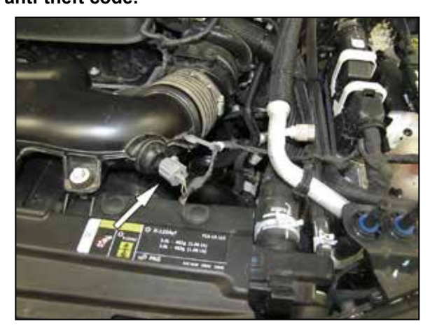
2. Disconnect the inlet air temperature sensor electrical connection and unhook the wiring harness from the intake tube.

NOTE: Disconnecting the negative battery cable erases pre-programmed electronic memories. Write down all memory settings before disconnecting the negative battery cable. Some radios will require an anti-theft code to be entered after the battery is reconnected. The anti-theft code is typically supplied with your owner's manual. In the event your vehicles anti-theft code cannot be recovered, contact an authorized dealership to obtain your vehicles anti-theft code.