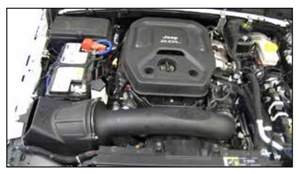
19. Reconnect the vehicle's negative battery cable. Double check to make sure everything is tight and properly positioned before starting the vehicle.

20. It will be necessary for all K&N® high flow intake systems to be checked periodically for realignment, clearance and tightening of all connections. Failure to follow the above instructions or proper maintenance may void warranty.