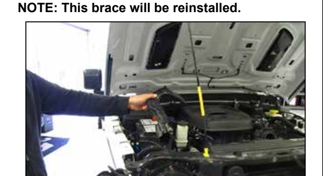
8. Remove the two bolts that secure the fresh air duct to the core support and then remove the duct from the vehicle.