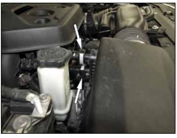
3. Depress the locking tab and disconnect the two vent lines from the air filter housing.