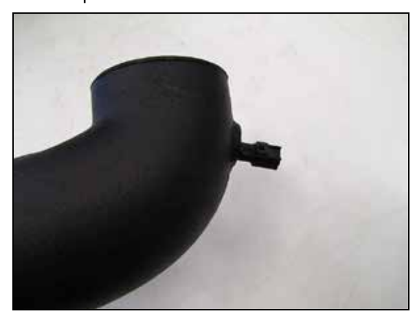
13. Remove the inlet air temperature sensor from the factory intake tube. Remove the O-ring from the sensor and then install the sensor into the K&N® intake tube using the provided grommet.