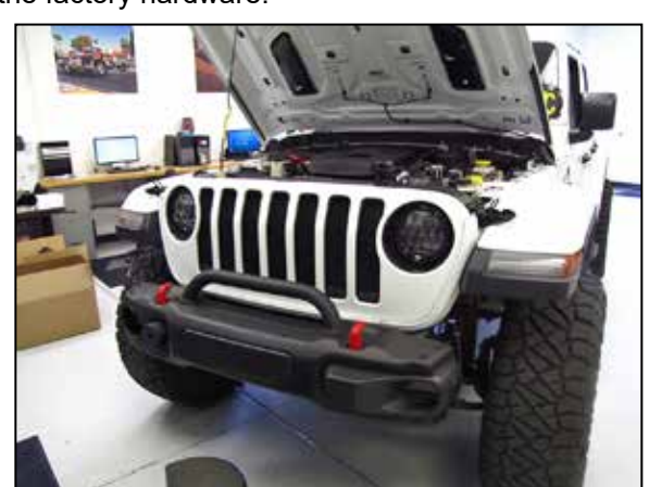
10. Reinstall the grill and secure with the factory retaining clips.