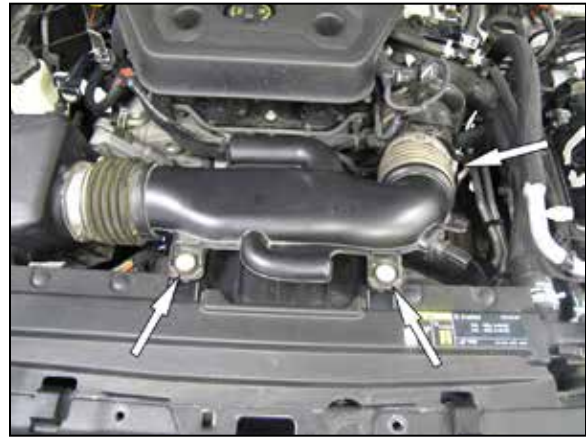
4. Remove the two bolts that secure the intake tube to the core support. Loosen the hose clamp securing the intake tube to the throttle body.