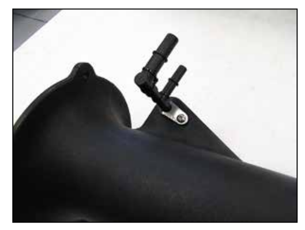
12. Install the O-ring onto the ejector fitting provided and then install the fitting into the K&N® intake tube. Secure the fitting with the clip and hardware provided.