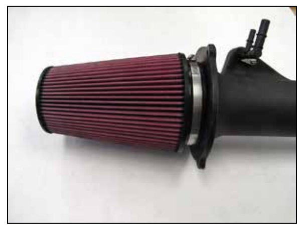
14. Install the air filter onto the end of the K&N<sup>®</sup> intake tube and secure with the provided hose clamp.