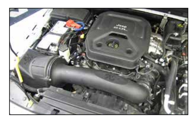
17. Install the intake assembly into the vehicle so the mounting studs insert into the mounting grommets and the intake tube inserts into the coupler. Secure the system with the provided hose clamp and hardware.