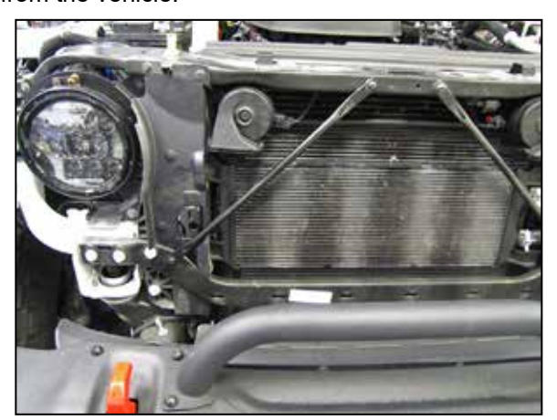
9. Reinstall the core support diagonal brace using the factory hardware.