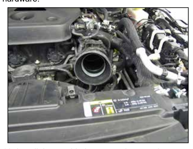
16. Install the provided step coupler onto the throttle body and secure with the provided hose clamp.