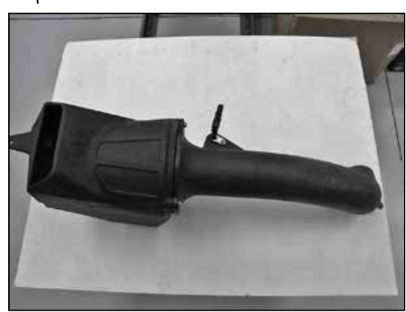
15. Install the intake tube assembly into the K&N<sup>®</sup> air filter housing and secure with the provided hardware.