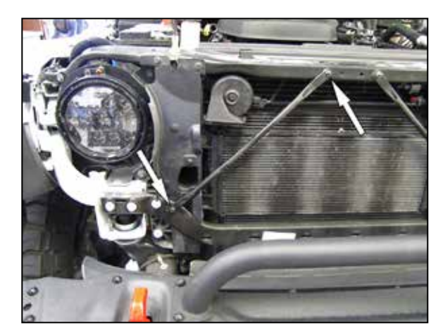
7. Remove the two bolts securing the diagonal core support brace and remove the brace.