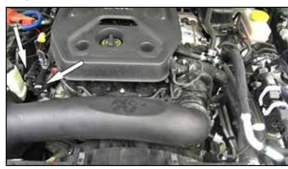
18. Connect the CCV lines to the ejection fitting installed into the intake tube.