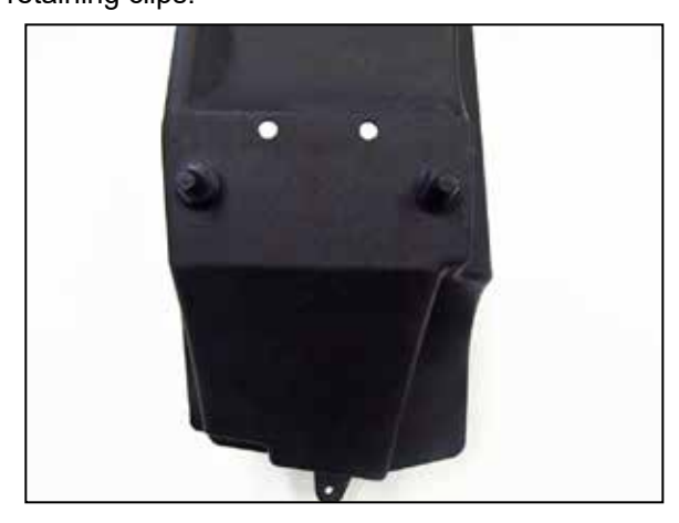
11. Install the provided mounting post onto the K&N<sup>®</sup> air filter housing using the provided hardware.