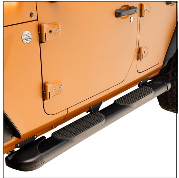
Product installed on JL 4 doors