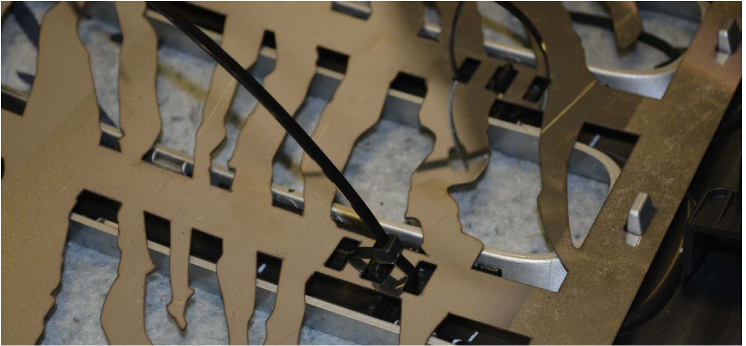
Figure 3 Secure the zip-tie into position, pull snug and then trim the excess.