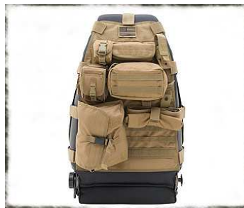
GEAR Seat Covers